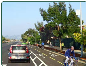
Cutting Boulevard (Richmond) Conceptual Rendering