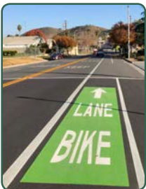
Colored Bicycle Lane Markings