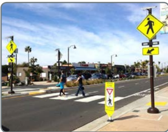
Flashing Beacons and High-Visibility Crosswalk